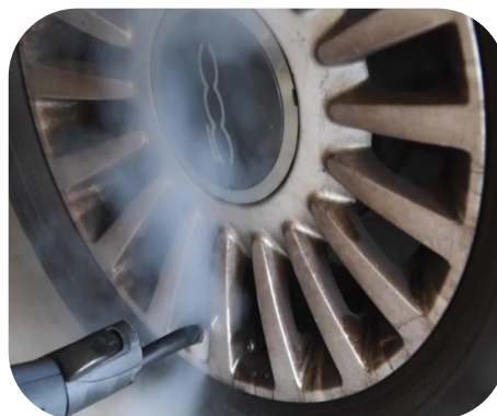
Cleaning the exterior of the car without damaging paint

You can also use this professional steam cleaner to clean objects inside your car, such as child safety seats or seat covers.