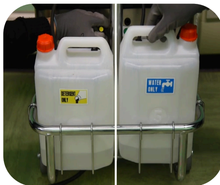
You can choose the most suitable detergent

VC 6000 not only removes dirt, but sanitizes both cloth and leather seats.