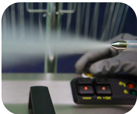
No problem, the steam will take care of it!

Proper steam sanitizing restores your car to its former glory and increases its commercial value. VC 6000 takes care of your vehicle with the utmost attention, both inside and outside. Steam regenerates the leather of seats, fabrics, plastics, carpets, inserts in natural and synthetic materials, glass, chrome and metals, mechanic components, without attacking the surfaces. It is possible to automatically add detergent during cleaning.