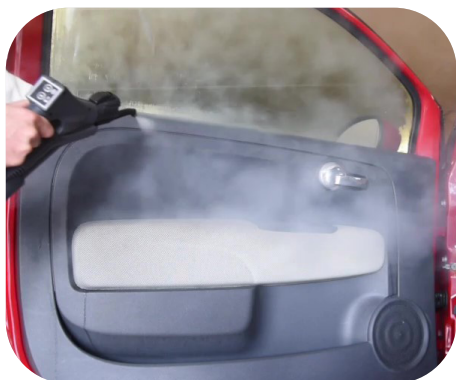
Impeccable interior cleaning

VC 6000 is equipped with 2 tanks, each one with a capacity of 5 L, so that the most suitable detergent for your car detailing can be chosen.