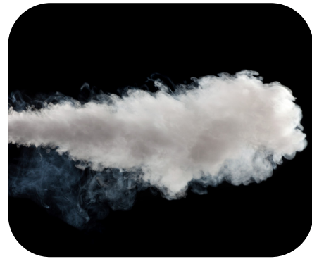
Pressure of 6 bars

AKR is equipped with a continuous refill system. You will be able to sanitize without ever having to stop.