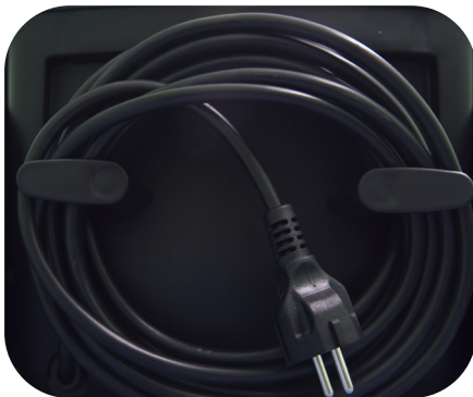
Smart cable winder

AKR generates steam at a temperature of 165°C and at a pressure of 6 bars. The sanitizing power of steam allows different types of surfaces to be cleaned quickly and efficiently, ridding them of stubborn dirt.