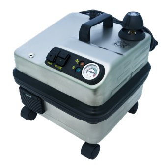
AISI 304 stainless steel large boiler (4 L)

Robby is a steam cleaner designed to be very versatile thanks to the wide range of accessories supplied.