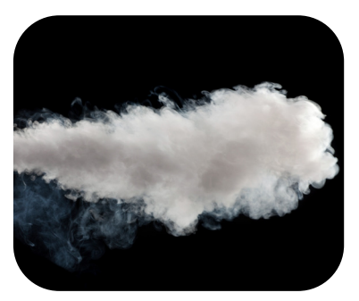
Steam at a temperature of 155°C and pressure at 4.5 bars

The hot water function envisages the delivery of a mixture of steam and a water solution to remove stubborn dirt more effectively.