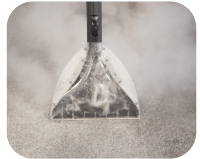
Washing-hot water extraction function

This patented probe is an excellent device for a steam cleaner, since it allows the water level to be constantly monitored in boilers that have a continuous refill system. It also helps monitor the limescale level inside the system: you only need to unscrew it to easily remove any limescale present, thus avoiding the service costs.