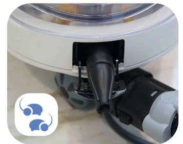
Patented Slalom System

Easy to use, with digital suction controls right on the handle.