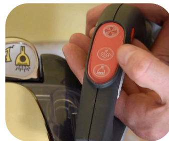
Handle for suction control (with 3 adjustment levels)

A practical solution to clean your steam cleaner in a few simple steps.