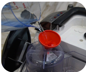
Continuous refill system

According to the contents of the bottle, it is possible to obtain either a mixture of steam with a water-detergent solution, or a mixture of steam and water, used with the hot water function.