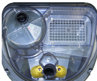
Patented Easy Clean System

SW3 is equipped with a continuous refill system. You will be able to sanitize without ever having to stop.