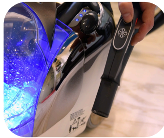
Handle for suction control (with 3 adjustment levels)

The Easy Clean system allows a complete and effective cleaning of the filter system. The tank was designed to be removed and washed under running water. A practical solution to clean your steam cleaner in a few simple steps.