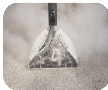
Washing-hot water extraction function

This patented probe is an excellent device for a steam cleaner, since it allows the water level to be constantly monitored in boilers that have a continuous refill system. It also helps monitor the limescale level inside the system: you only need to unscrew it to easily remove any limescale present, thus avoiding the service costs.