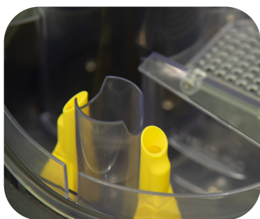
Patented RAIN SYSTEM water filter with Venturi technology

Our steam cleaners that combine steam and suction sanitization use Rain System technology. Pollen, mites, molds, spores and microparticles are sucked into the special patented water filter where two removable and washable side nozzles constantly nebulize high-pressure water, blocking all types of incoming contaminants and giving the environment a perfectly purified-outlet air stream.