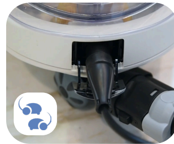
Patented Slalom System

Easy to use, with digital suction controls right on the handle.