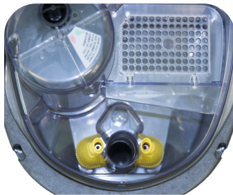
Patented Easy Clean System

SW4 is equipped with a continuous refill system. You will be able to sanitize without ever having to stop.